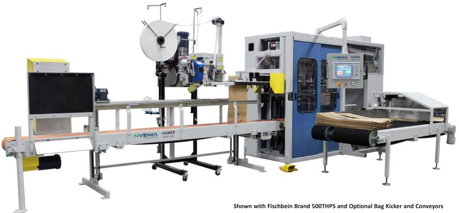
Shown with Fischbein Brand 500THPS and Optional Bag Kicker and Conveyors

The Model 3597 is capable of handling flat or gusseted, multi-wall open mouth paper, plastic, poly, and laminated woven polypropylene bags, as well as all forms of pinch bags.