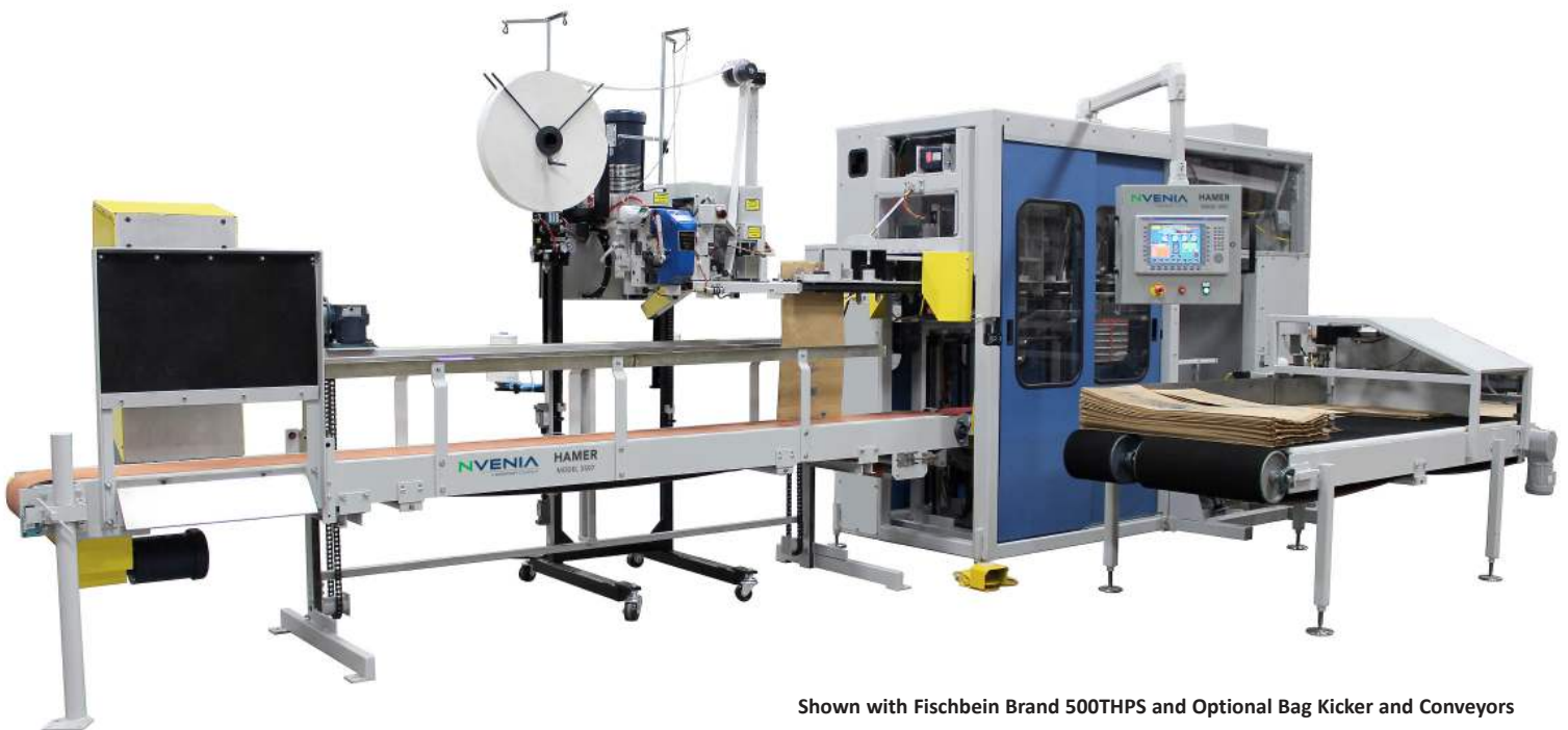
Shown with Fischbein Brand 500THPS and Optional Bag Kicker and Conveyors

The Model 3597 is capable of handling flat or gusseted, multi-wall open mouth paper, plastic, poly, and laminated woven polypropylene bags, as well as all forms of pinch bags.