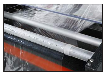
Optional Adjustable Perforator with Brush Roller