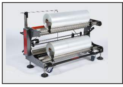
Optional Compact Dual Roll Powered Centerfolder