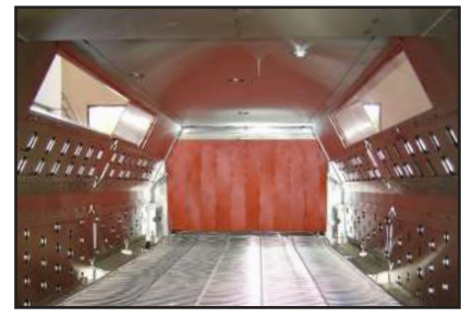
Chain Mesh Belt & Viewing Windows on Both Sides