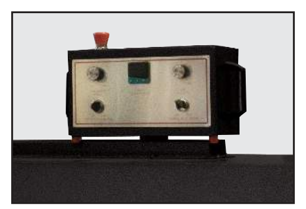
Easy To Use Swivel Control Panel