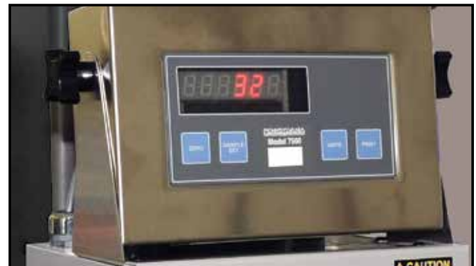
Optional Wrap-N-Weigh Operator Display