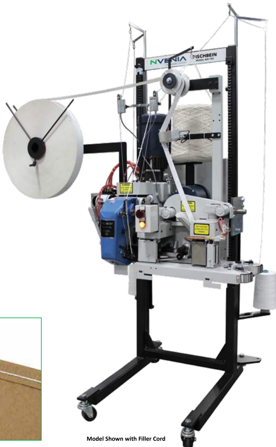
Model Shown with Filler Cord

The Model 400 TNS™ automatically trims the top of the bag, applies the tape, sews the bag closed and lastly cuts the crepe tape and thread at the completion of each sewing cycle.