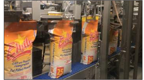
Bag Closing with Pinch-Top