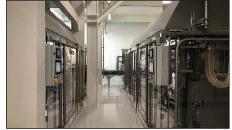
Filling Machine in High Care Zone